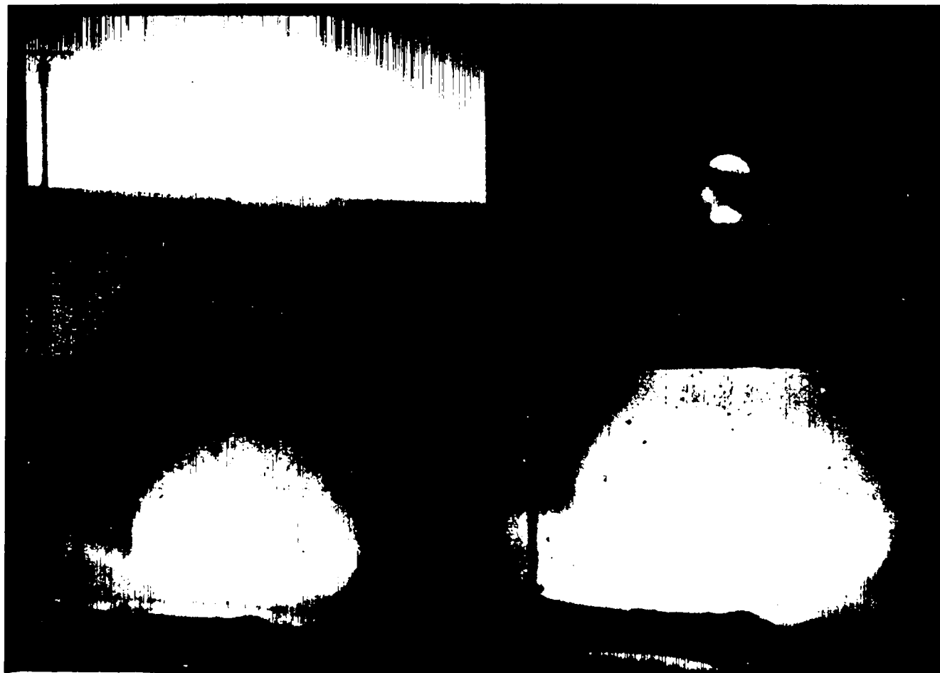
Figure 3. Early development of the upper atmospheric shock as seen from Haleakala (~9000 ft above sea level) on Maui Island.