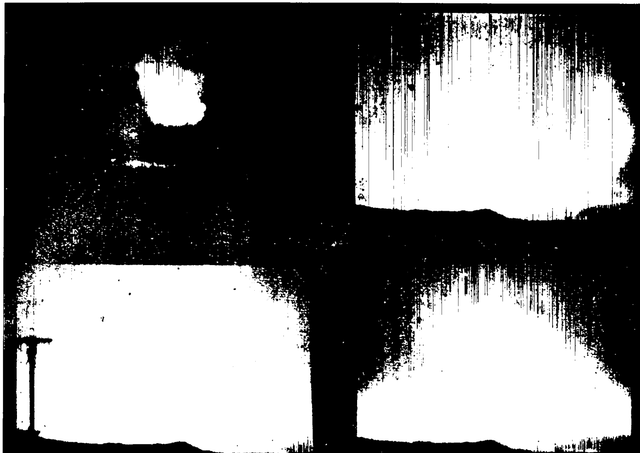
Figure 4. Late development of upper atmospheric shock and location of bomb debris, as seen from Haleakala.