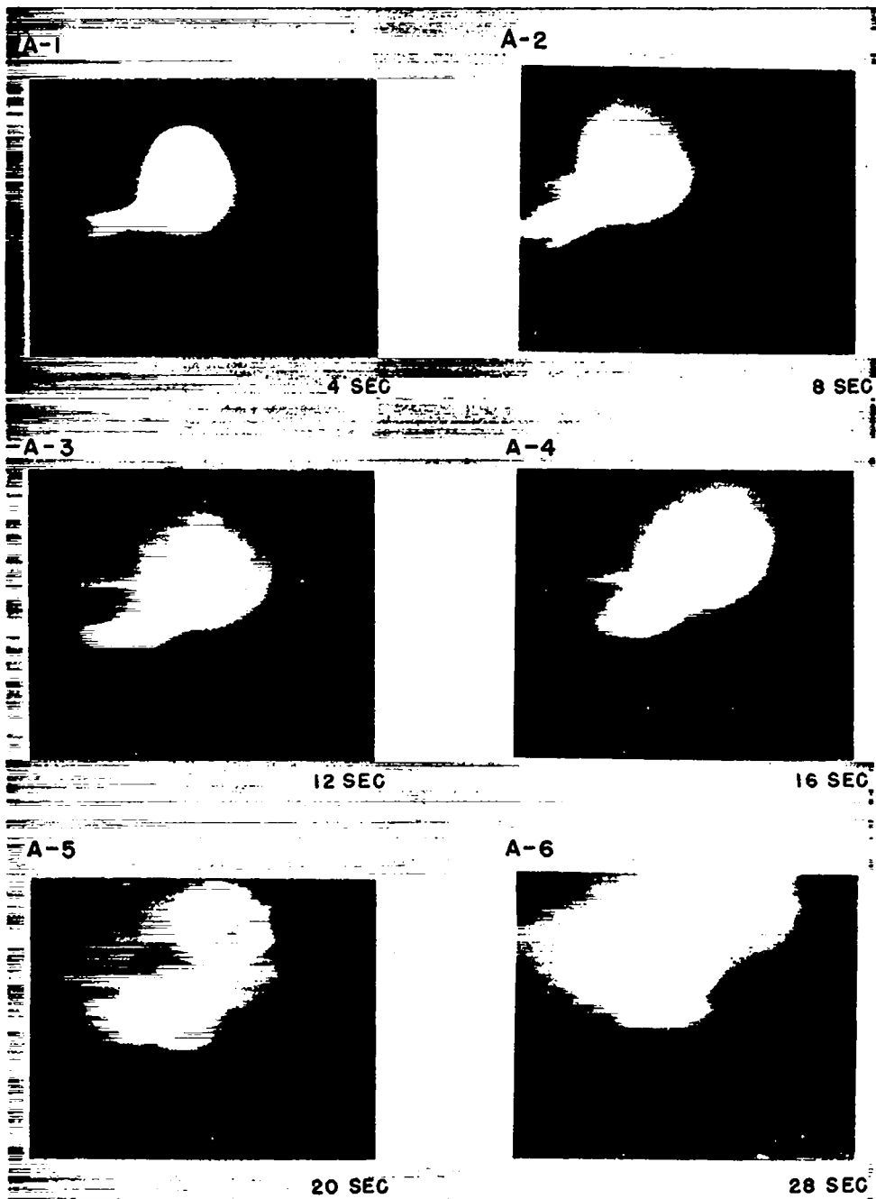
Figure 1. Late phases of Teak fireball and formation of northern branch of aurora as viewed from aircraft flying NW of explosion. Horizontal diameter of fireball at +3.5 sec was ~30 km.